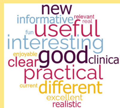
Figure 2: A word cloud illustrating the most popular adjectives used to describe the May 2024 course on feedback forms

Figure 3 shows the delegates' average reported increase in confidence in their knowledge of sedation and ability to plan a safe sedation plan after having completed the course.